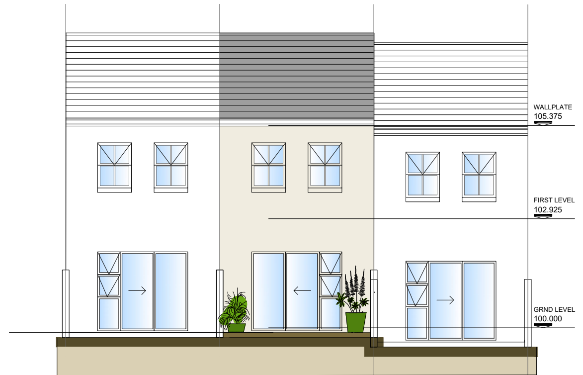
1:100 Back Elevation