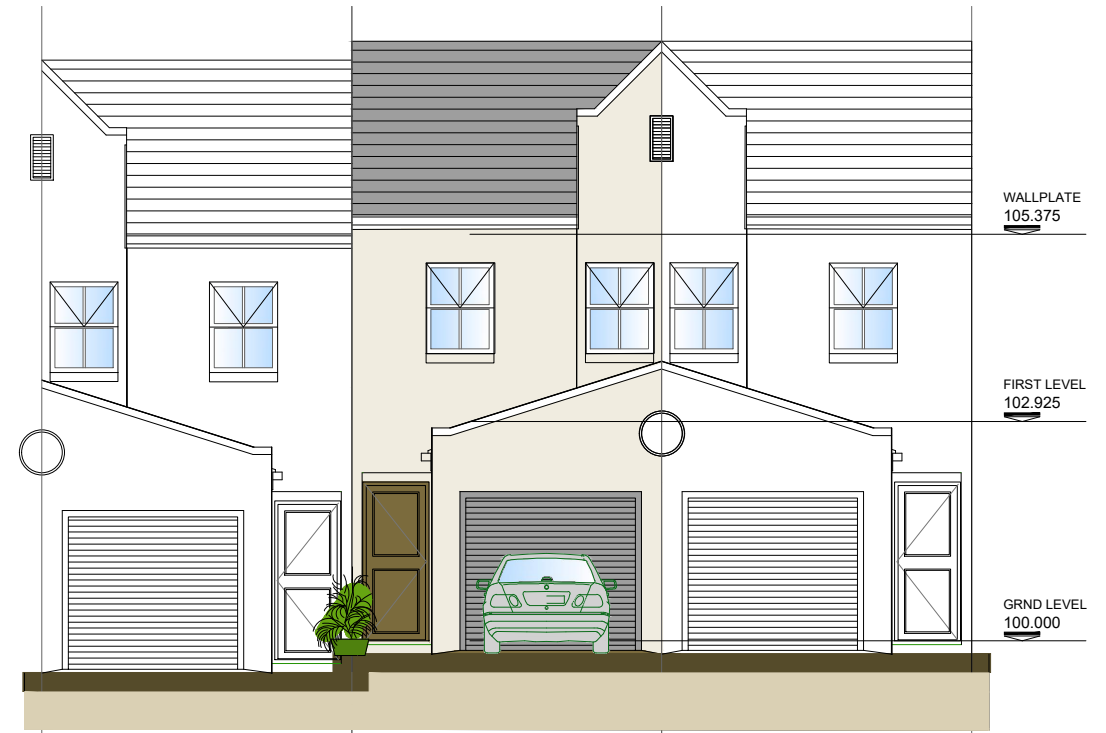
1:100 Front Elevation